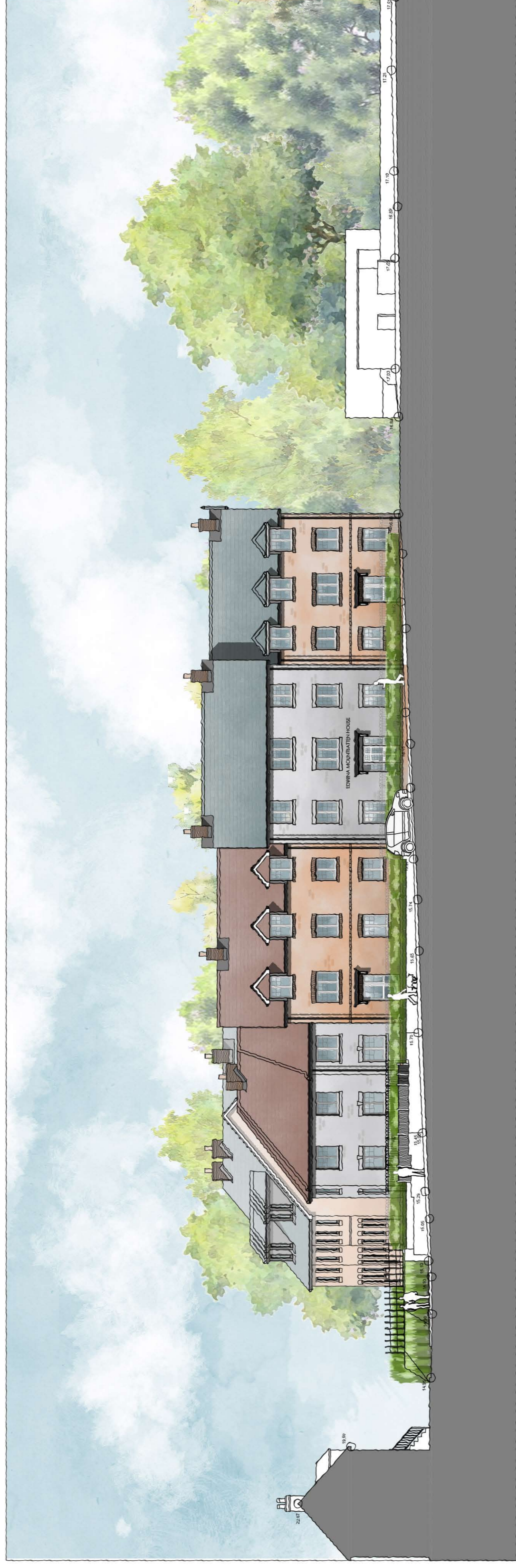
Broadwater Road Contextual Elevation