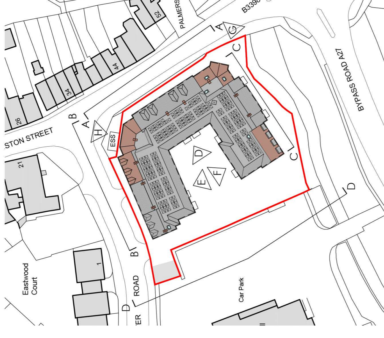
Key to Elevations